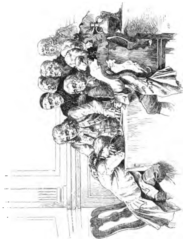
"' Harry, 'is I. Look up, my own boy, and say you forgive me.'"